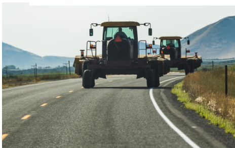
Improved Roadways & Bridges