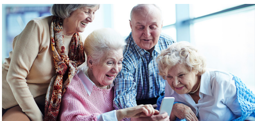
Senior Citizen Programs