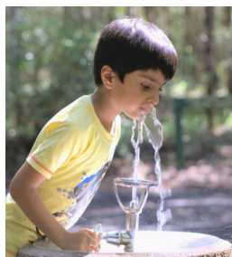
Improved Drinking Water