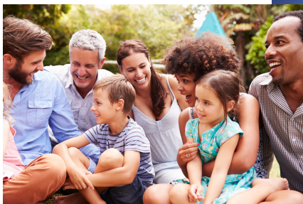
Healthcare, Nutrition Assistance, New Housing